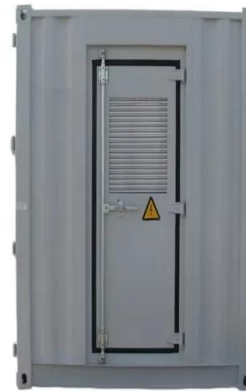
Photo-thermo-electric conversion system based on photothermal ...

Environmental factors significantly influence solar energy, leading to intermittency and unpredictability. These factors hinder the continuous energy conversion of photothermal materials, ...